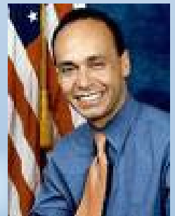
Congressman Luis Gutierrez US House of Representatives

"I came here primarily to express my solidarity with the people of India and to strengthen the relationship between the people of the United States and the people of India."