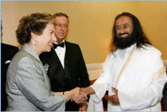
His Holiness Sri Sri Ravi Shankar, right, greets U.S. Congresswoman Schakowsky at the Art of Living Foundation's 25th anniversary celebrations in Washington D.C. as U.S. Congressman Joe Wilson looks on.