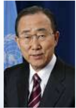
Hon. Ban Ki Moon Secretary General, United Nations

"Guru Sri Sri Ravi Shankar's contribution to the spiritual uplifting of the people of the world, and to the development and dissemination of human values across the "globe has been truly unique and unprecedented"