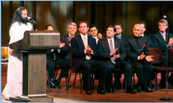
His Holiness Sri Sri Ravi Shankar introduced the Universal Declaration of Human Values at the Kennedy Center in Washington D.C. during the Art of Living Foundation's 25th anniversary celebrations. The declaration provides a pragmatic vision for the world community, representing a roadmap to foster understanding and harmonious coexistence among different peoples and cultures.