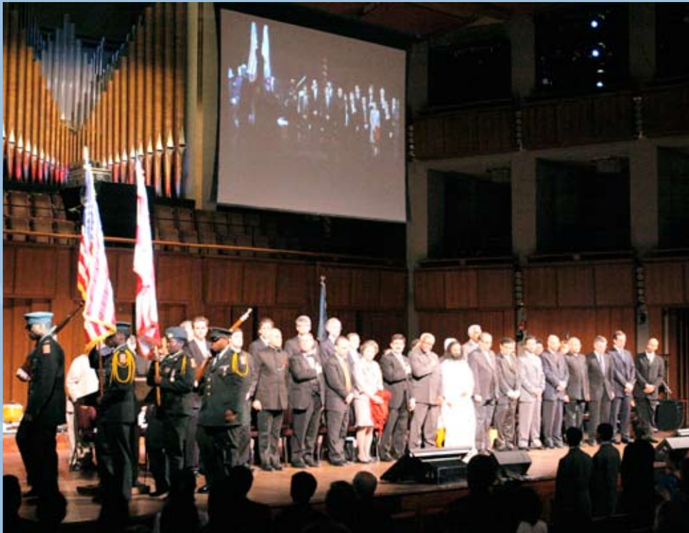
Congressmen, senators, diplomats, Nobel laureates, judges, business leaders and others joined His Holiness Sri Sri Ravi Shankar on stage at the Kennedy Center in Washington D.C. during the Art of Living Foundation's 25th anniversary celebrations.

The movers and shakers of the United States of America felicitated His Holiness Sri Sri Ravi Shankar for his invaluable contributions to the world community at the prestigious John F Kennedy Centre in Washington DC on March 28, 2007. Prominent members of Congress and Senate, educators, professionals, scientists, ambassadors, judges and business leaders came together in acknowledging and honouring the work of the Art of Living and H H Sri Sri Ravi Shankar at the Art of Living Silver Jubilee gala, held at the Kennedy Centre.