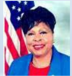
Congresswoman Diane E. Watson US House of Representatives

"I came here primarily to express my solidarity with the people of India and to strengthen the relationship between the people of the United States and the people of India."