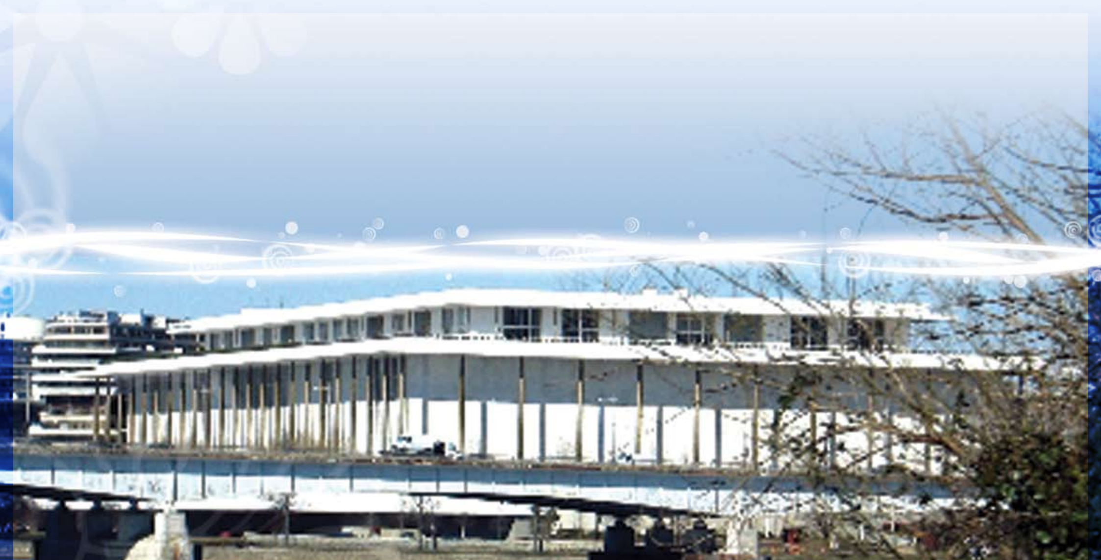
Kennedy Center, Washington DC